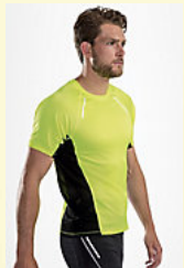
SOL'S SYDNEY MEN 01414